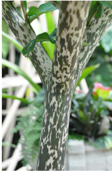
Close up of petiole