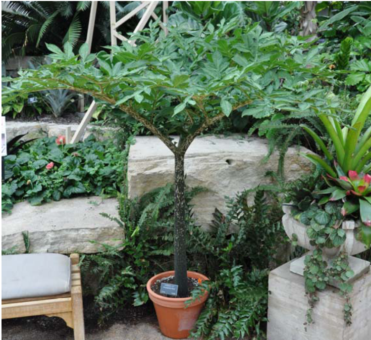
Five-foot specimen in the Conservatory