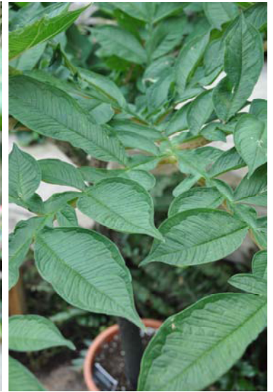
Close up of divided leaf